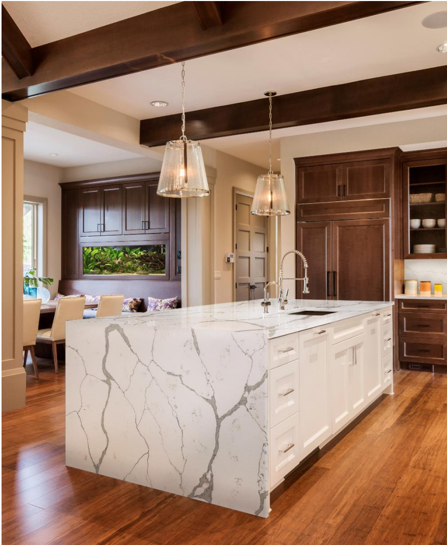
Zodiaq® Calacatta Natura residential kitchen installation

Functional unit is 1 m 2 (10.8 ft 2 ) of product for a period of 10 years in use.