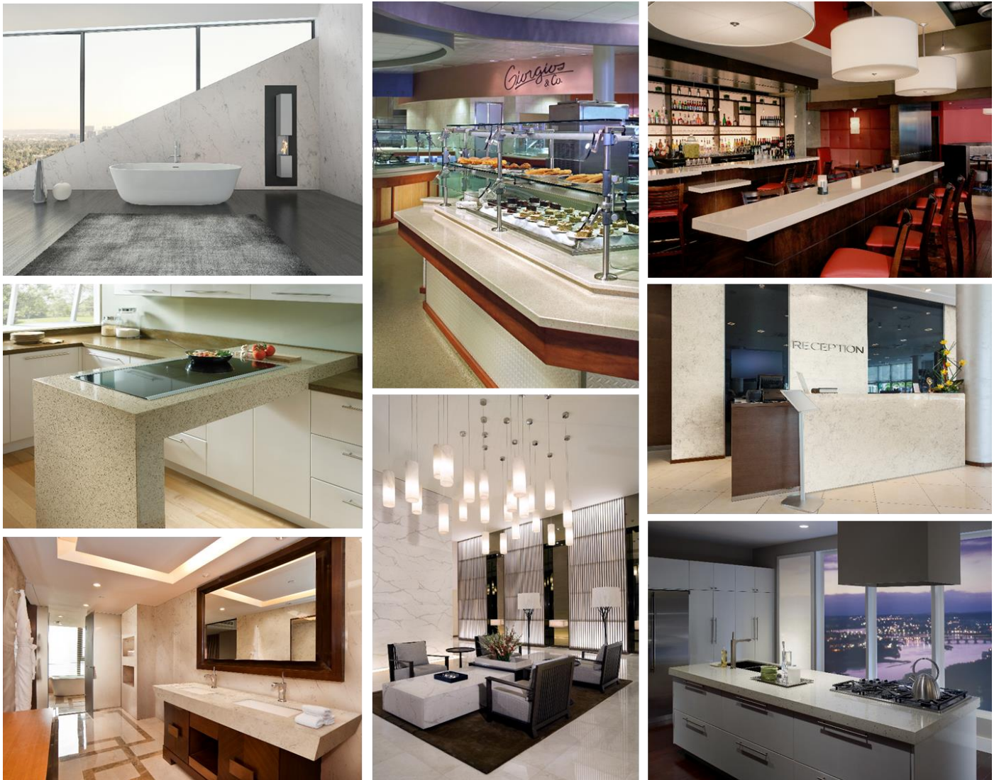
Figure 1: Photographs of Zodiaq® quartz in its various applications